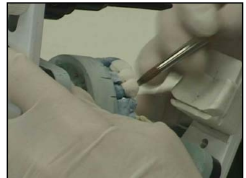
Fabricated on models

We want the entire procedure of getting a bridge to be comfortable for you, so first we make sure that your mouth is thoroughly numb. To prepare your teeth for the bridge, we remove any decay and use the dental handpiece to shape the teeth precisely.