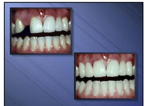
A restored mouth

During your second and final visit, we remove the temporary bridge and try in your new bridge. We check the fit and your bite, and when everything looks good, we cement your new porcelain bridge in place.